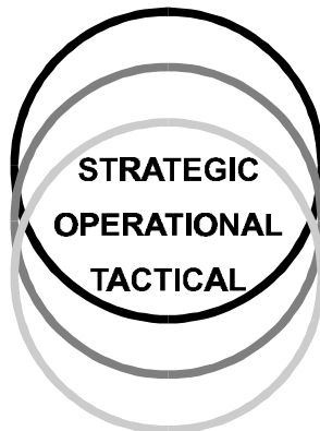
Figure 2. The Levels of War Compressed.

The distinctions between levels of war are rarely clearly delineated in practice. They are to some extent only a matter of scope and scale. Usually there is some amount of overlap as a single commander may have responsibilities at more than one level. As shown in figure 1, the overlap may be slight. This will likely be the case in large-scale, conventional conflicts involving large military formations and multiple theaters. In such cases, there are fairly distinct strategic, operational, and tactical domains, and most commanders will find their activities focused at one level or another. However, in other cases, the levels of war may compress so that there is significant overlap, as shown in figure 2. Especially in either a nuclear war or a military operation other than war, a single commander may operate at two or even three levels simultaneously. In a nuclear war, strategic decisions about the direction of the war and tactical decisions about the employment